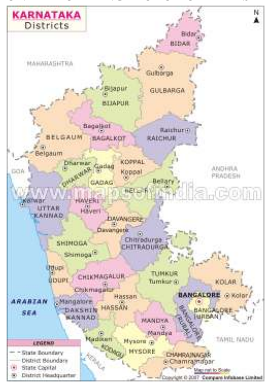
Annexure - 1: LOCATION MAP OF BENGALURU RURAL DISTRICT IN KARNATAKA